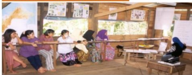
From make shift office in 1996

As at 31 Dec 2016, KOPEL has 290 members and 80% of the income goes back to the members