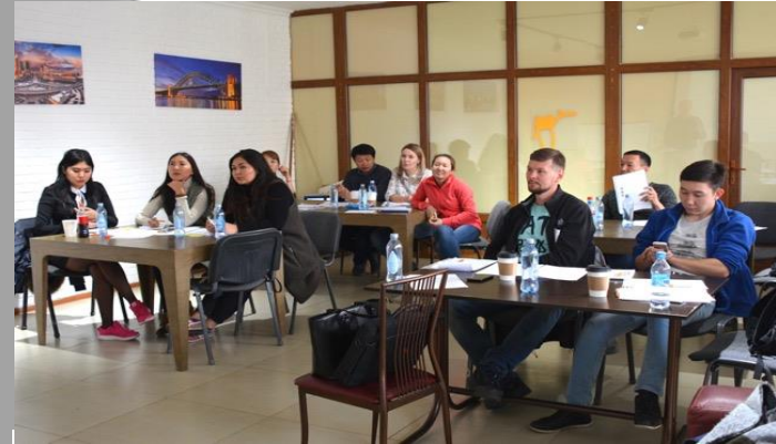
EastguidesWest certified Tour Leaders