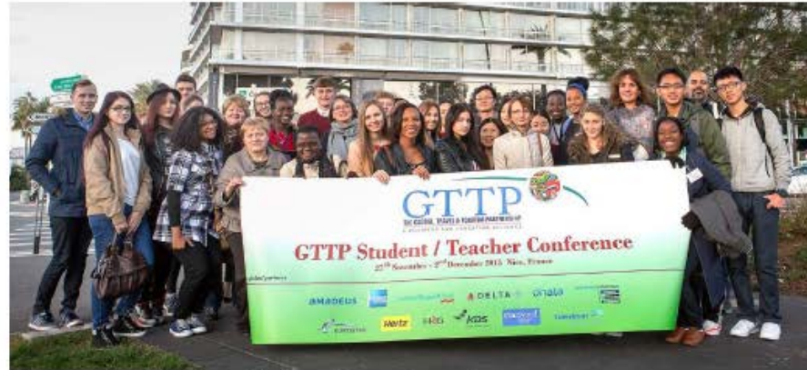
Annual Student/Teacher Conference