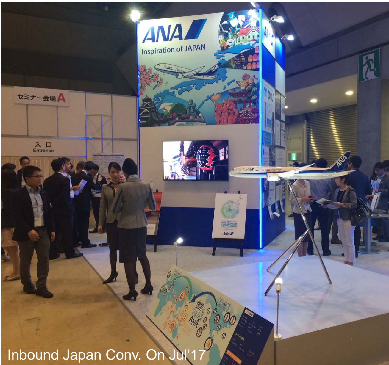
Inbound Japan Conv. On Jul'17