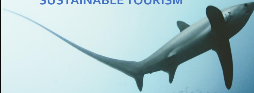
Thresher Shark, Malapascua Island